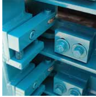
Spring loaded retainer locks, adjustable wire positioners, and adjustable inserter needle positioners.