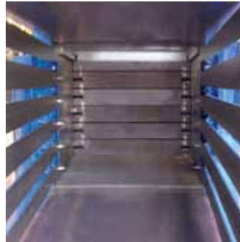
Wear resistant, replaceable Nylatron liners on the ram slides. 500 Brinell steel liners on the floor and ram bottom. Oversized ram hold-down bars are adjustable from the exterior of the machine.