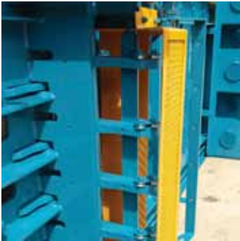
Wire positioners are on the twister cabinet side for precise twister alignment and wire pick-ups.