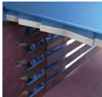
Serrated body and ram bolt-in shear blades are shimmable and replaceable (not available in the PC-Series, WC, and EWC models).