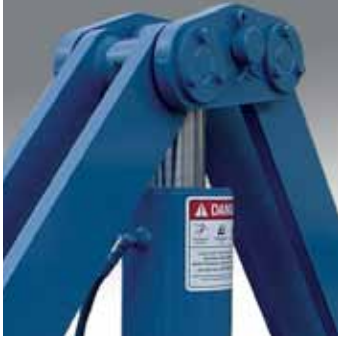
Single cylinder bale tensoning system with linkage bars provides up to 1 million pounds of extrusion force.