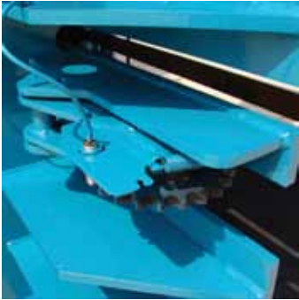
Spring loaded counter wheel, located on the side of the baler, sends a digital reading to the operator interface.