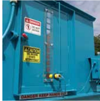
The in-feed hopper has viewing windows on both sides and a hopper door with full gasket. Infrared photoelectric sensors are adjustable to the height of the hopper door window.