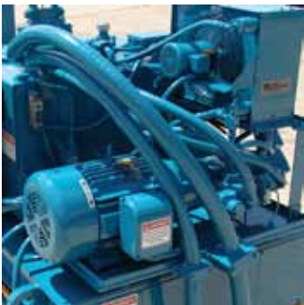
TEFC motor with quiet running pump system.